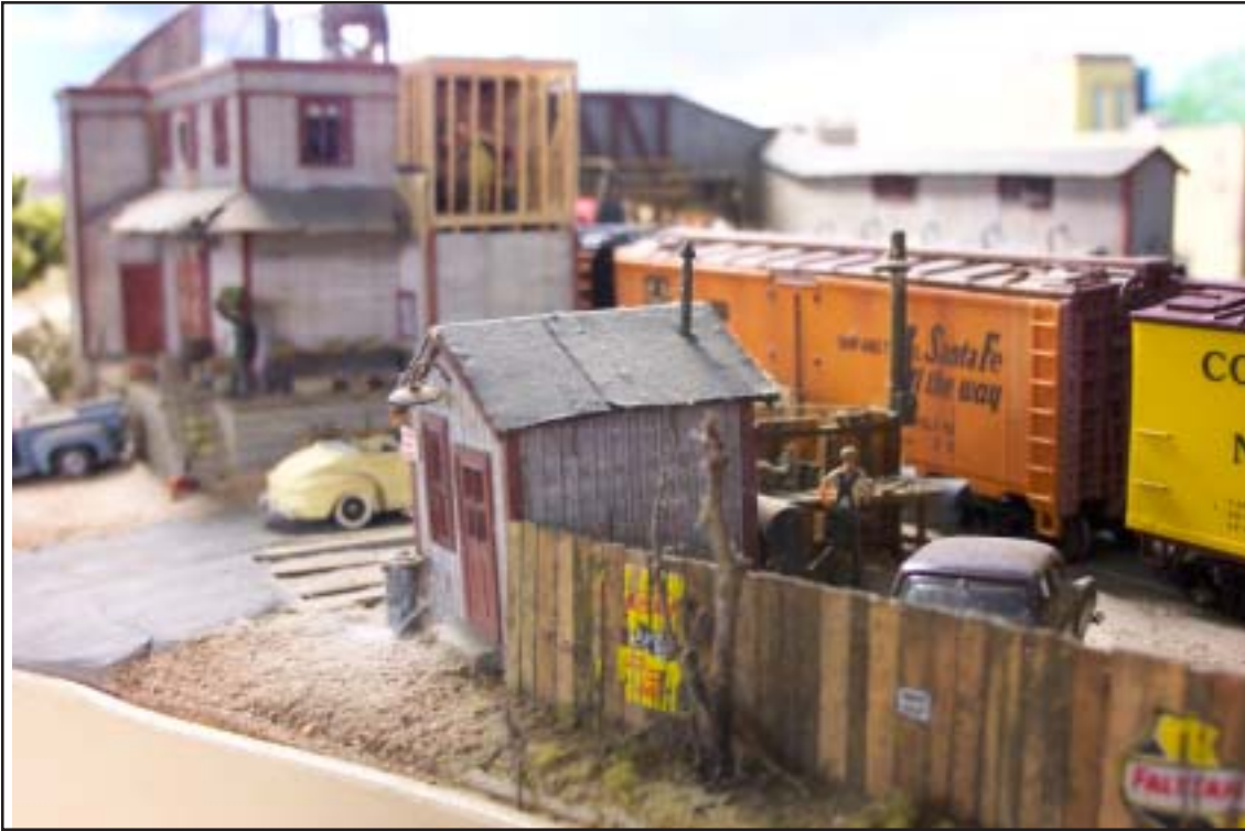
Details make the difference - Dick Trotter's "Coyote Pass & Northern" HO Layout