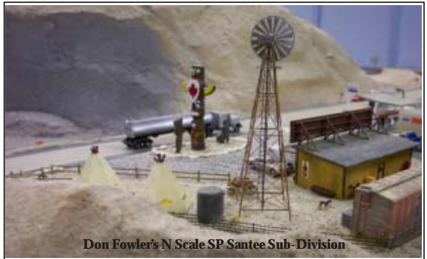
Don Fowler's N Scale SP Santee Sub-Division

on April 17th (St. Patrick's Day). There will be a "gathering" at Mimi's Diner right off Route 78 in Oceanside at 8:00am. Order breakfast (you're on your own) and prepare for a fun day!