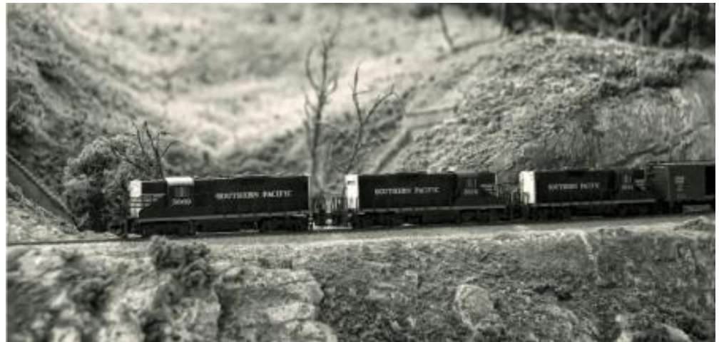
(Above: GP-9s on Cape Horn)

We will host the PSR San Diego Spring meet on Saturday May 11. Details to follow. Clinics will be Paul Schmitt, MMR, doing "Ballasting Track" and Bill Ewing and Pete Steinmetz on "Building Lighting and Soldering Magnet Wire to Surface Mount LED's" The Surface Mount LED's will be used to light the building. We hope to be projecting the soldering and detail on a big screen so everyone can see the construction methods.