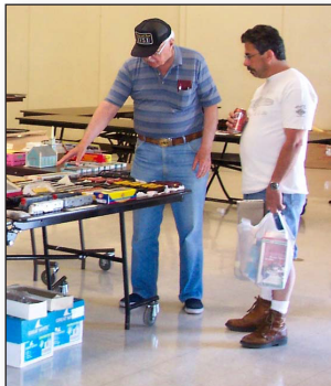
Making a sale!