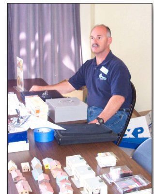
Multi-tasking - our intrepid paymaster collecting and selling