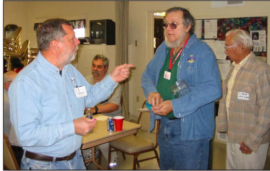
Making a point