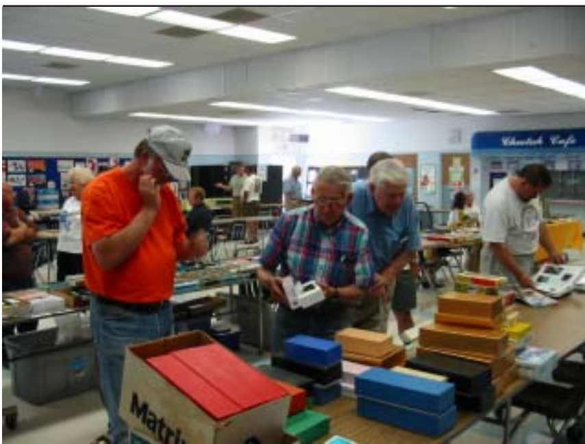
May Swapmeet

Dec 4-5 - GATS, San Diego, CA . 11 AM - 5 PM. $7.00. Del Mar Fair, 2260 Jimmy Durante Blvd. North See www.GATS.com for discount and details. (630) 834-0652