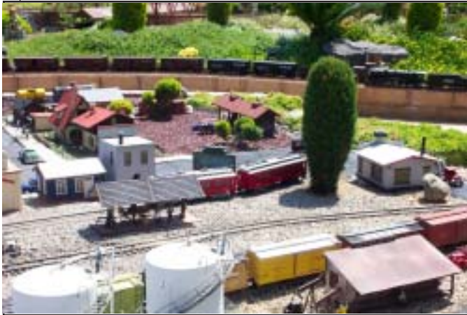
Now that is a garden railroad! - Rodger Clarkson

We've had a busy few months with tours to several excellent local layouts, plus a road trip to Riverside County at the invitation of the Cajon Division. It's always great to sniff out all the interesting animated scenes on Rodger Gredvig's pike, and seeing Randy Schissler's "little" layout