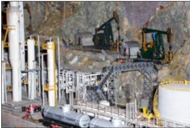
Dominy's - 2004

of these layouts have been featured in the magazines and Steve was seen most recently on the cover of Model Railroader, November 2004.