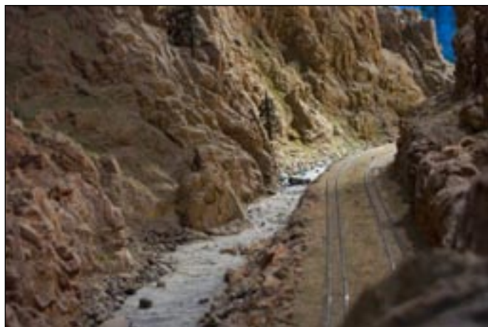
Yes - It's a Model - Pasadena 'S' Gauge Club

All layout tours are from noon to 300 PM and directions will be sent to you by postcard one week prior to the tour. The tour to Brawley in November is a long drive and if you are interested in sharing the cost of a rented van let me know and I will arrange it. Get busy on your layouts and I want to get a call from you letting me know you want to host a tour in 2006. That means you, BS, PS, DD, JB, and ???