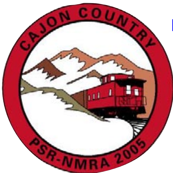
YMR Display - PSX2004