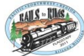
PSR 2011 Convention