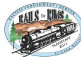
PSR 2011 Convention