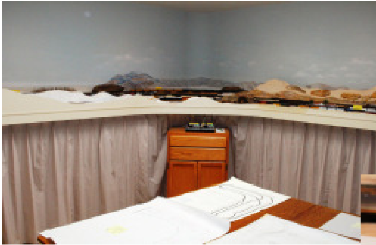
Above: The center of Steve's layout. The white are is unfinished plaster. R: The Kelso depot.

We visited Steve Ulmer, to appreciate his 30-inch wide N-scale shelf layout, 14 feet by 18 feet dogleg layout, cantilevered from the wall (no legs) around the dining room. It was initially designed as a display layout for guests to enjoy while eating, and also includes a variety of industries for switching operations. There are two loops; a figure eight inside a dog-bone with a double crossover between the loops in the downtown area. The railroad is set in the Transition era, in the local southwest desert with the town of Kelso, CA as the focal point – this is UP and BNSF country. Construction began in the early 90s and by the late 90s, just after the track was powered, it