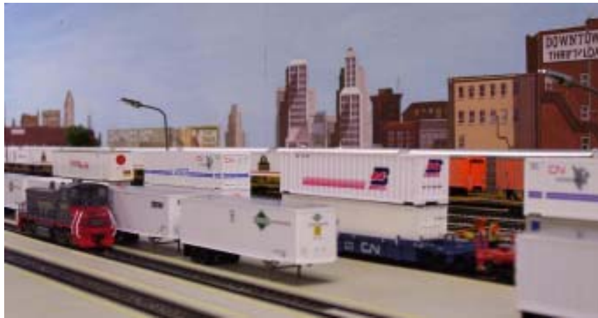
Don Fowler's N scale layout

and sharing our mutual interests in model railroading. I am constantly amazed at the talent and skills that our members possess. I am also very grateful to have an understanding and supportive wife who not only enjoys the hobby with me, but actively participates in Division activities as well.